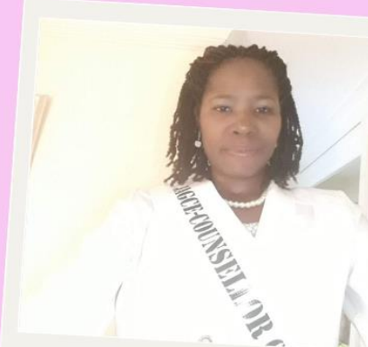
Counsellor of the Year 2017

Jamaica Teachers Association TIP Friendly Society Institute of JAR Econ Office and School Supplies Sagicor Insurance PITECH