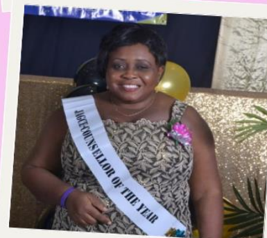
Counsellor of the Year 2021