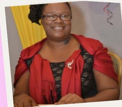
Counsellor of the Year 2018